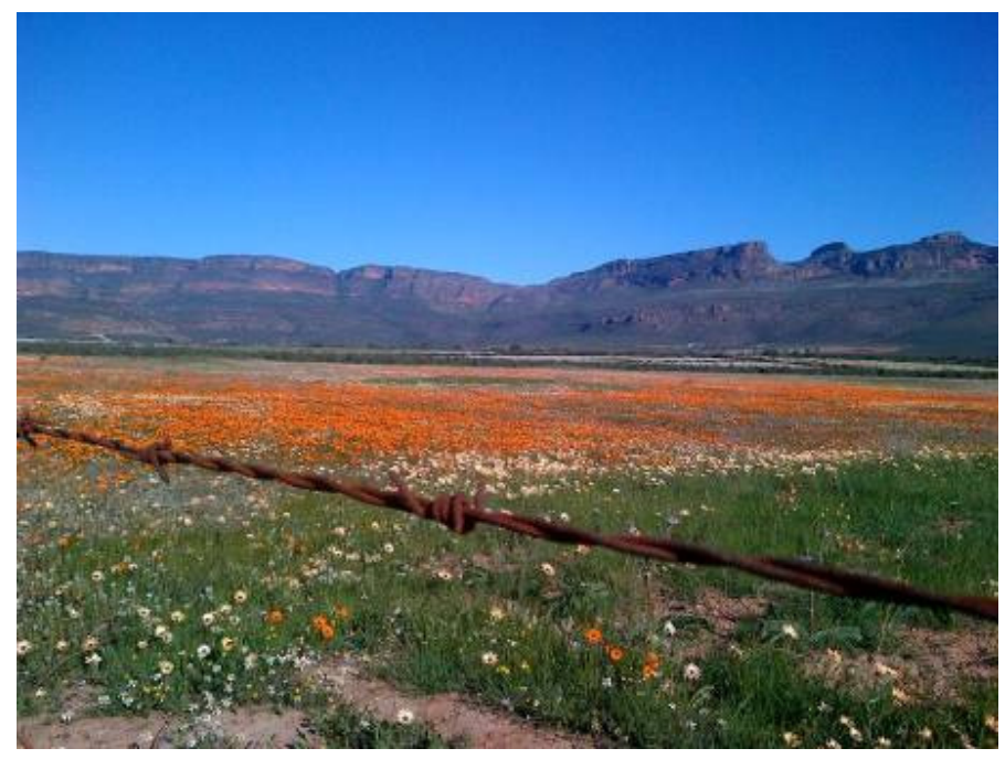
Flower Route on Maskam Guest Farm